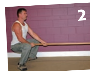
Downward thrust (exhale) then retract back to the start position (inhale).