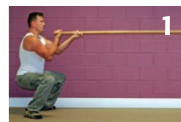
Sequence #2: start position. Take your grips as shown and assume a deep horse-stance.