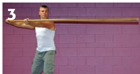
Forward thrust (exhale) then retract back to start position (inhale)...