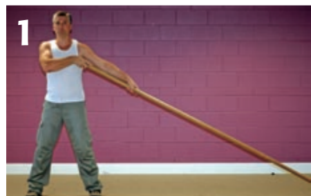
Sequence #1: Space your hands correctly like so before lifting the pole to your centre.