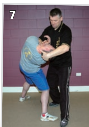
7 ...then immediately moves forward, twisting the hopefully unconscious attacker's head as he takes him down...