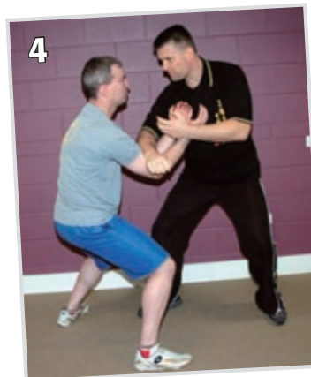
4 ...causing the knee-strike to fall short and the attacker to land hard on the ground, jarring him and putting him off balance...